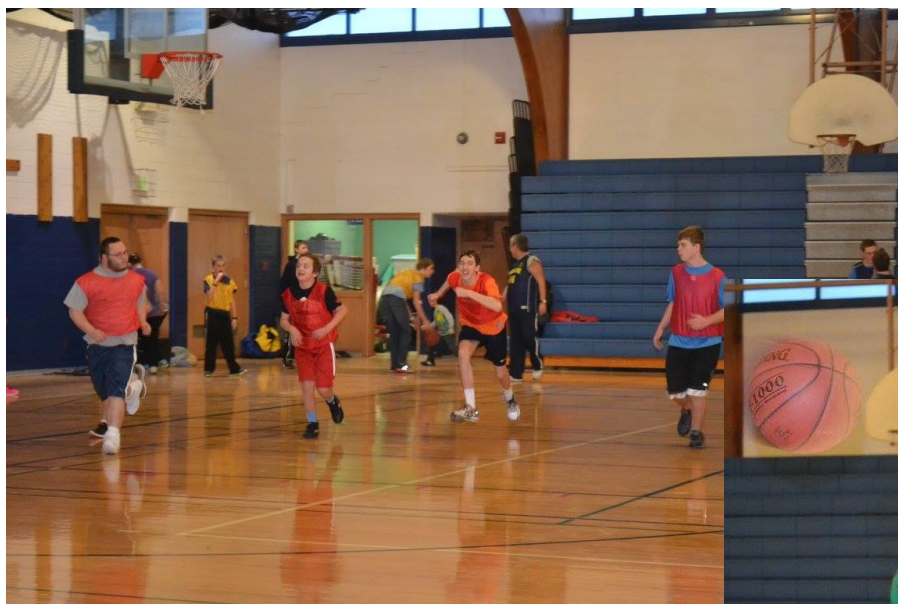
Action shots from basketball practice!