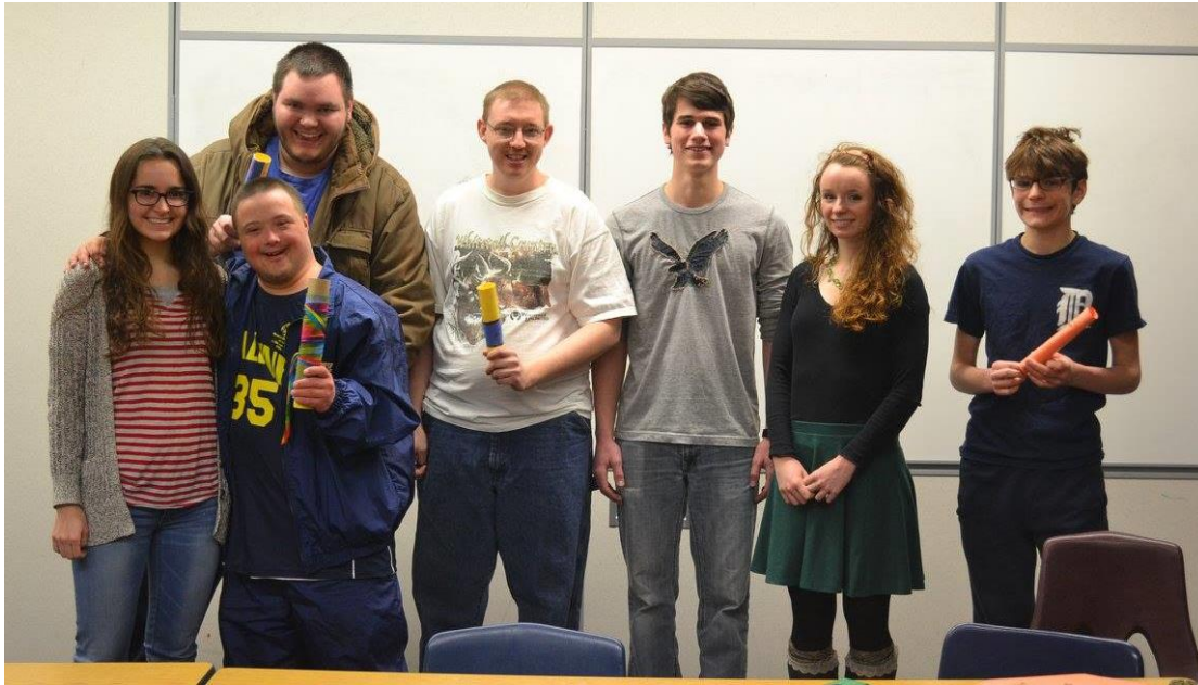
Baton decorating with Special Olympics!