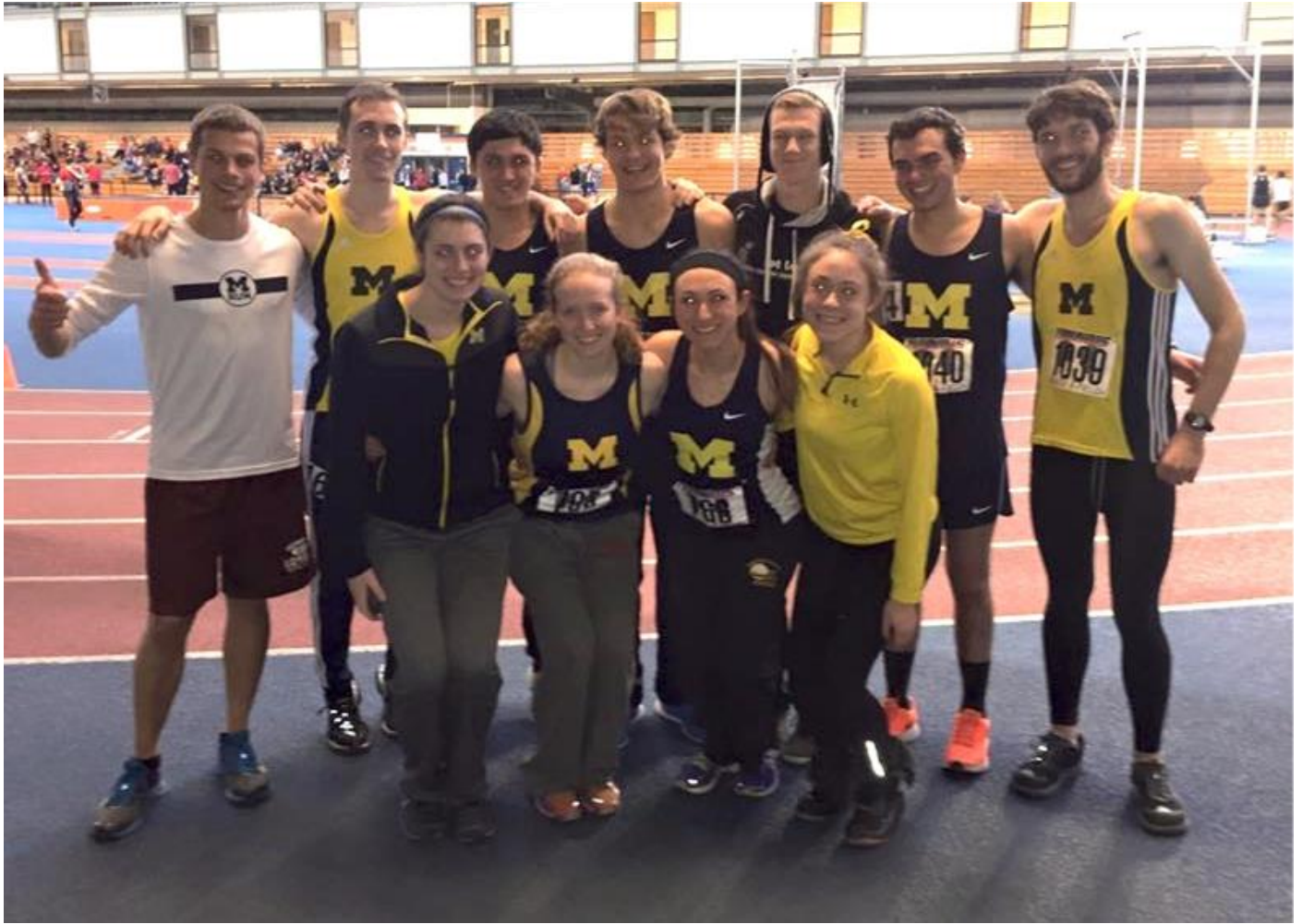
Group Photo from Illinois Club Relays!